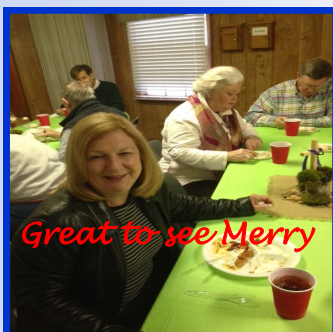
Great to see Merry