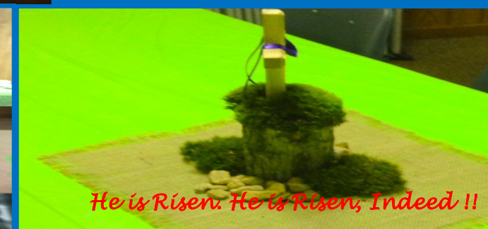
He is Risen. He is Risen, Indeed !!